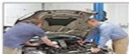
Bentley technical authors testing fuel pump on the Cooper S engine.

Though the do-it-yourself MINI owner will find this manual indispensable as a source of detailed maintenance and repair information, the owner who has no intention of working on his or her car will find that reading and owning this manual makes it possible to discuss repairs more intelligently with a professional technician.