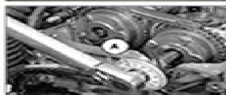
Detailed engine service, including VANOS camshaft timing adjustment N12 Camshaft Timing Chain