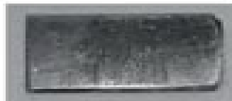
Line Up Plate