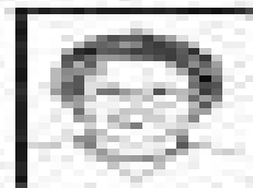
Portrait of a man