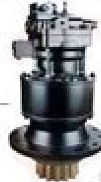
3.2 Swing Motor Assy