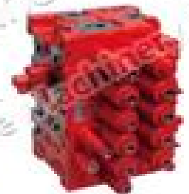
3.3 Main Control Valve