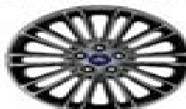
16" Gloss Black Aluminum† Optional on SE