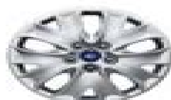
16" Steel with Sparkle Silver-Painted Cover Standard on S