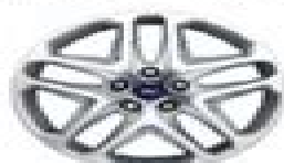
17" Sparkle Silver-Painted Aluminum Standard on SE