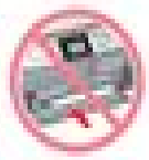
Do not do

Caution: Do not push the paper to the left. Make sure the paper is loaded correctly. Load plain paper only.