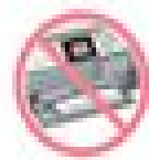
Do not do