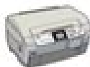
Epson Stylus Photo RX700