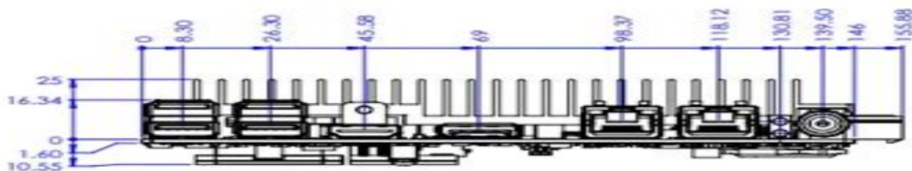
Figure 6. Mechanical Diagram with Heatsink (Coastline)