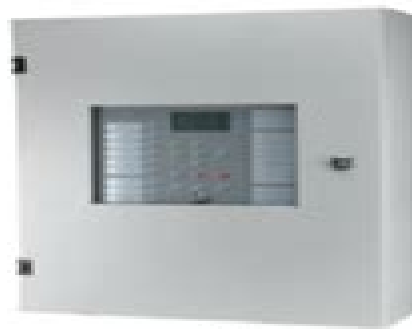
FMZ 5000 mod S 909222