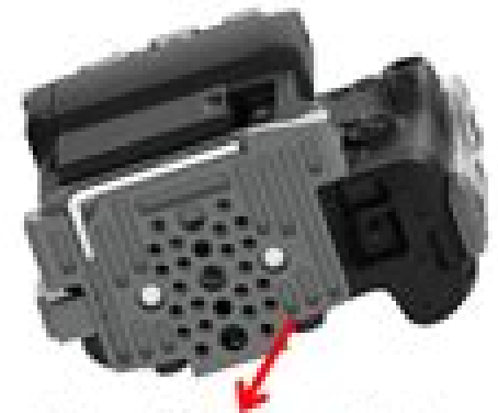
Cage Bottom Plate