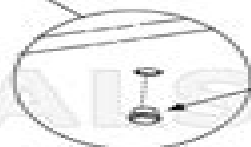
Subbase Water Plug

To ensure maximum efficiency it is recommended to check to ensure the rubber drain plug is properly inserted. This plug may be removed during operation to minimize water in the back of the unit; however, removing it will lower the efficiency of your unit.