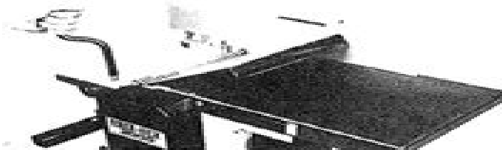
Höhenverstellung bei abmontiertem Abgabebereich

Der Dickentisch wird nicht mehr über Zahnriemen, sondern über eine Kette verstellbar. Die Kurbel zum Verstellen ist dadurch nicht mehr seitlich angebracht (die Hinweise auf Seite 16 erübrigen sich).