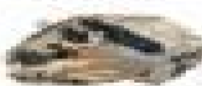
Photomicrograph of a mafic igneous rock (Basalt) showing a fine-grained texture with dark, interlocking crystals.