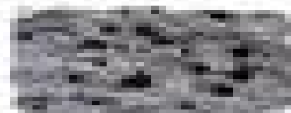
Photomicrograph of a mafic igneous rock (Basalt) showing a fine-grained texture with dark, interlocking crystals.