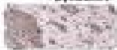
Photomicrograph of a mafic igneous rock (Basalt) showing a fine-grained texture with dark, interlocking crystals.