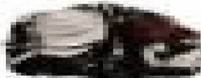
Photomicrograph of a mafic igneous rock (Basalt) showing a fine-grained texture with dark, interlocking crystals.