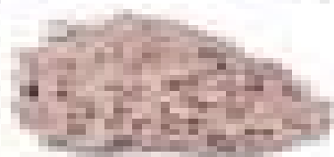
Photomicrograph of a mafic igneous rock (Basalt) showing a fine-grained texture with dark, interlocking crystals.