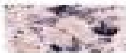
Photomicrograph of a mafic igneous rock (Basalt) showing a fine-grained texture with dark, interlocking crystals.