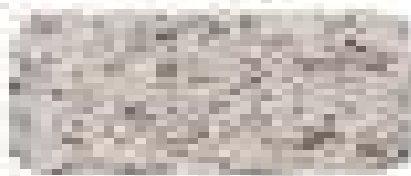
Photomicrograph of a mafic igneous rock (Basalt) showing a fine-grained texture with dark, interlocking crystals.