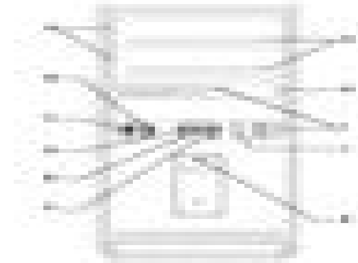
Diagram illustrating the structure of a cell, showing various organelles and their functions.