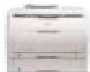
HP Color LaserJet 3800 Printer series HP Color LaserJet 3800dn shown