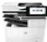
HP LaserJet Managed Flow MFP E62665z