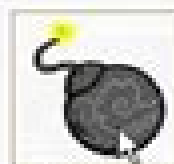
Thick Smoke Bomb