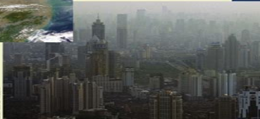
Shanghai, China, is one of a number of Asia's large cities that have been polluted and darkened by the regional haze from the cocktail of pollutants in the South Asian Brown Clouds.