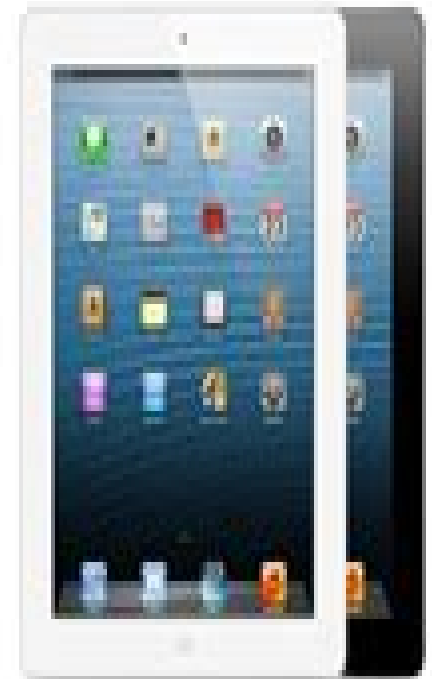
iPad avec écran Retina