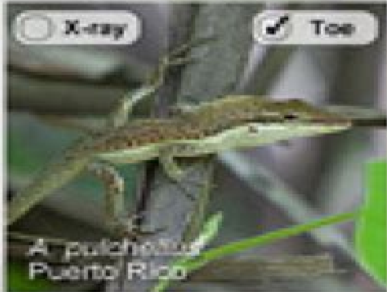
A. pulchellus Puerto Rico