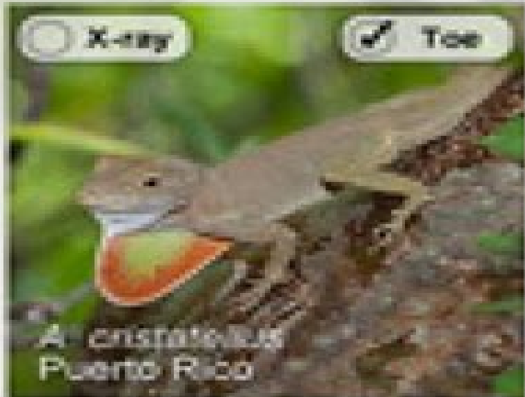
A. cristatus Puerto Rico