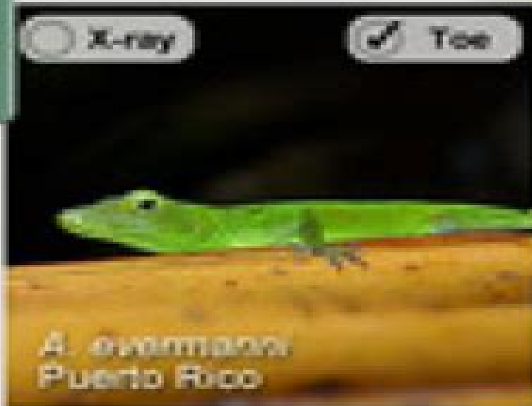
A. evermanni Puerto Rico