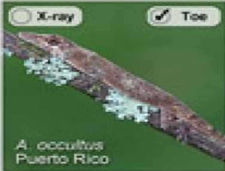
A. occultus Puerto Rico