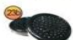
Tail Light Bulb