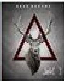
Dear Dreams JIN