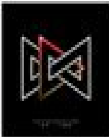
EP. TWO The Eastern Library