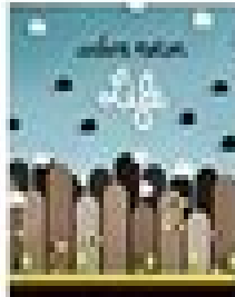
Life Uniform Motion