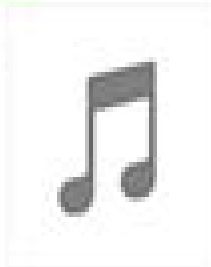
Jessie J, Ariana Grande...