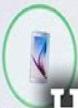
SAMSUNG 2011 Galaxy S2