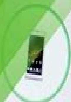
SONY Xperia SP C3303