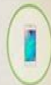
SAMSUNG 2011 Galaxy S2