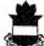
RAFFLES GIRLS' PRIMARY SCHOOL