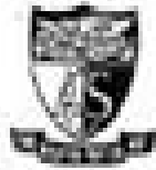
ANGLO-CHINESE SCHOOL (PRIMARY)