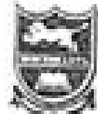
TAO NAN SCHOOL