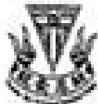
CATHOLIC HIGH SCHOOL (PRIMARY)