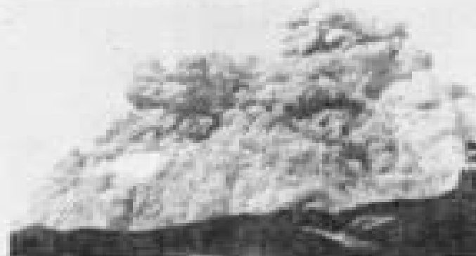
Source: Journal of the American Statistical Association , 1997, 92, 1039-1052.