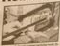
Work on the connecting rod is done in the engine block. The rod is held in place by the piston pin.