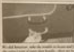
Work on the connecting rod is done in the engine block. The rod is held in place by the piston pin.