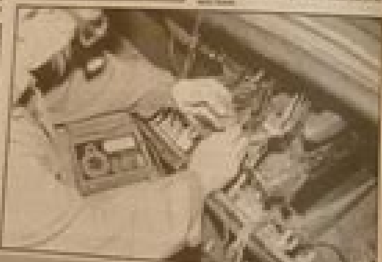
Work on the connecting rod is done in the engine block. The rod is held in place by the piston pin.