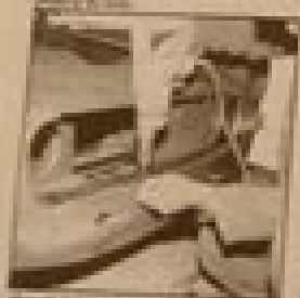
Work on the connecting rod is done in the engine block. The rod is held in place by the piston pin.