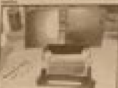
Work on the connecting rod is done in the engine block. The rod is held in place by the piston pin.