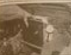
Work on the connecting rod is done in the engine block. The rod is held in place by the piston pin.

The engine is the heart of the car, and it's the most important part of the rebuild. But at least the car is in good shape and ready to be built. The engine is the heart of the car, and it's the most important part of the rebuild. But at least the car is in good shape and ready to be built.