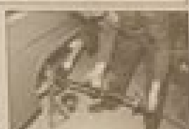
Work on the connecting rod is done in the engine block. The rod is held in place by the piston pin.