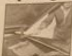
Work on the connecting rod is done in the engine block. The rod is held in place by the piston pin.