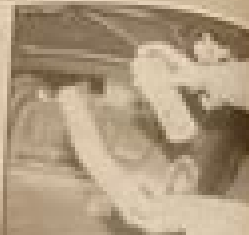
Work on the connecting rod is done in the engine block. The rod is held in place by the piston pin.