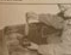
Work on the connecting rod is done in the engine block. The rod is held in place by the piston pin.