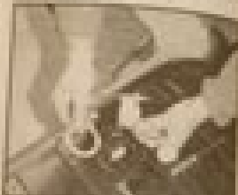
Work on the connecting rod is done in the engine block. The rod is held in place by the piston pin.