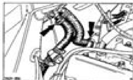
Fig. 25. Remove hot water hoses.