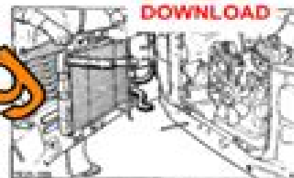
Fig. 24. Remove radiator grille panel with radiator.