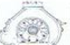
Ford 1A, 209, 302, 351C, 351W