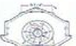
GM TH-400, 350, 250-48, 700R4, 3.80, 4.10, 4.62R Chevrolet