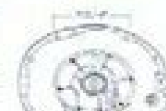
Chrysler TH-727 & 904, 373, 374, 340, 360