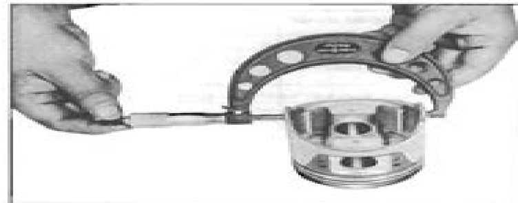
Fig. EM-49 Measuring the piston diameter