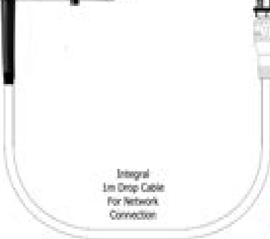
Integral 1m Drop Cable For Network Connection