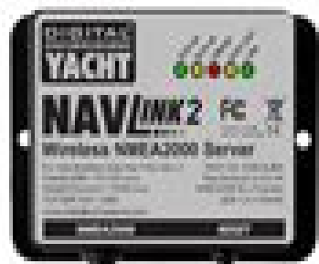
Wireless NMEA 2000 Gateway/Server