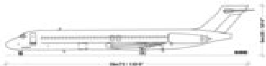
McDonnell Douglas MD87