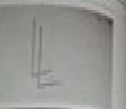
Fig. 1.14 The scene from Fig. 1.13, showing the light from the window and lamp.

The first step is to assign the light sources to the objects in the scene. The window is the primary light source, and the lamp is the secondary light source.