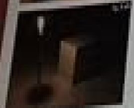
Fig. 1.11 The scene from Fig. 1.10, showing the light from the window and lamp.

The next step is to assign the light sources to the objects in the scene. The window is the primary light source, and the lamp is the secondary light source.