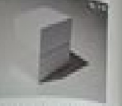
Fig. 1.15 The scene from Fig. 1.13, showing the light from the window and lamp.

The next step is to assign the light sources to the objects in the scene. The window is the primary light source, and the lamp is the secondary light source.