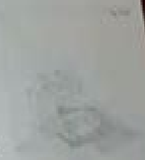
Fig. 1.18 A simple scene for global light-bouncing examples.