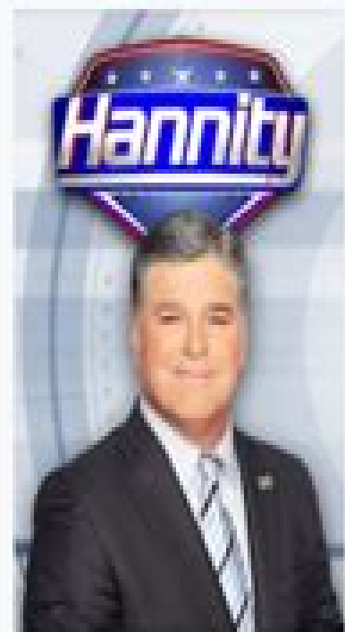
Hannity Weeknights at 9 pm