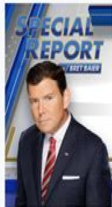
Special Report with Bret Baier Weeknights at 6 pm

Watch Live View Schedule On Air Personalities