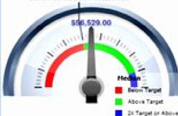
Median Household Income by Age

$0 $10,000 $20,000 $30,000 $40,000 $50,000 $60,000