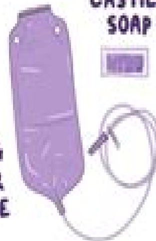
ENEMA BAG w/ TUBING & RECTAL TUBE