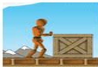
Sam pushing but box not moving