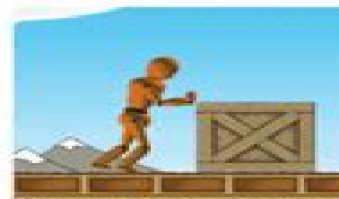
Sam pushing and box moving

b. Check your sketches using the sim and make corrections if needed. List any new ideas you discovered.