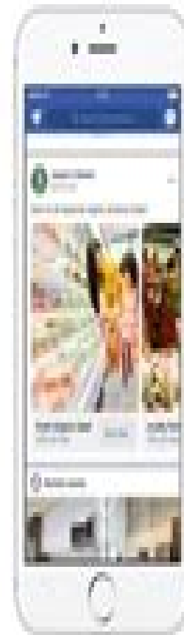
Facebook Marketplace (Desktop & Mobile)