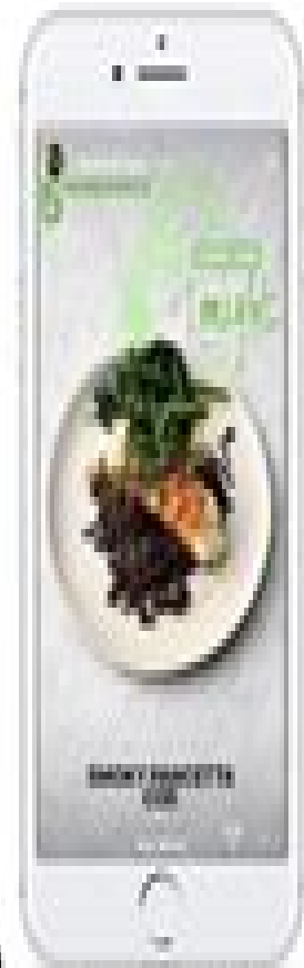
Facebook Stories (Mobile)