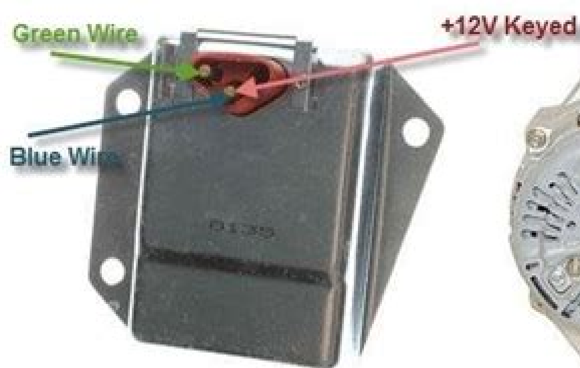
Napa #ECH VR38