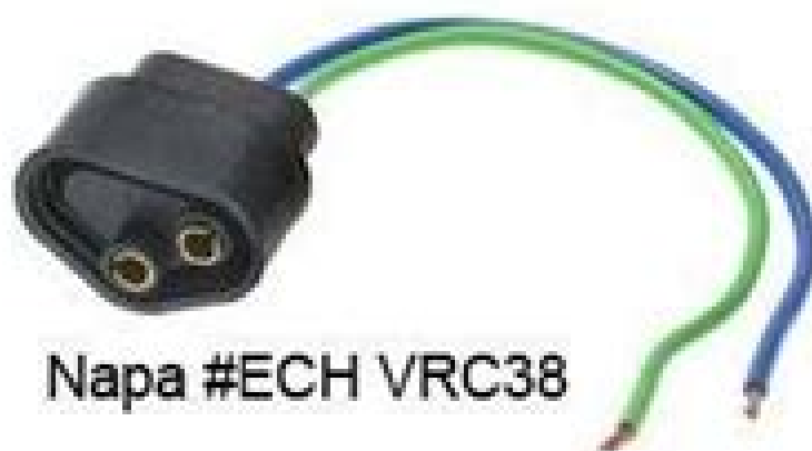
Napa #ECH VRC38

But blue wire gets hooked to keyed 12V power also. This is the only wire that should go to +12V keyed and the alternator both.