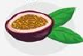
FRUIT DE LA PASSION