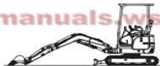
Bucket position at the time of checking the hydraulic oil level.

Hydraulic oil should be changed in every 500 service hours.