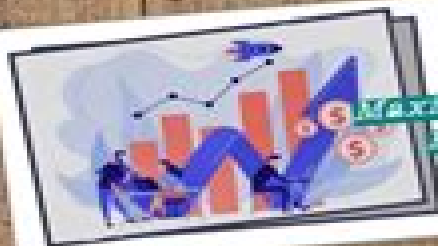
Page 101 Textbook Page 101 Classmate