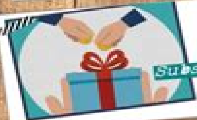
Page 101 Textbook Page 101 Classmate

The effect of welfare E.g. if the government provides loans to poor people. They will have more income to spend