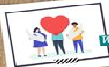
Page 101 Textbook Page 101 Classmate

Subsidies encourage increased output of favoured products but distort resource allocation and can affect foreign trade