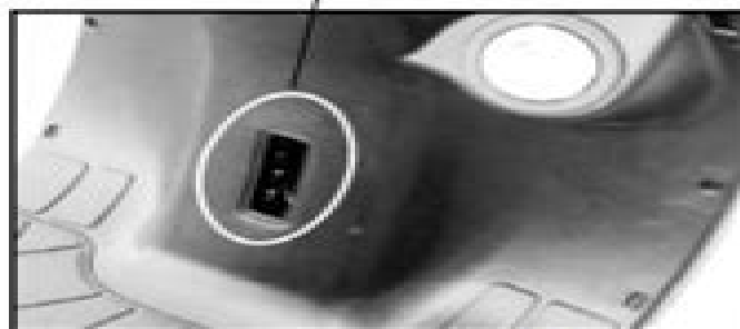
Location of Frame Serial Number