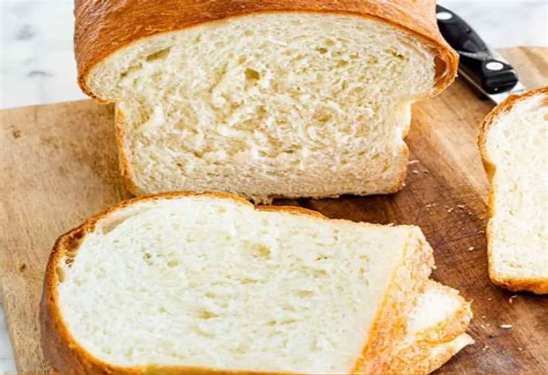
James Martin White Bread