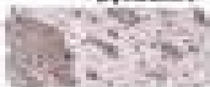
Photomicrograph of obsidian.