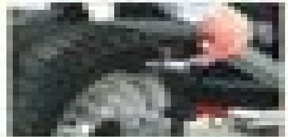
The Hunter GSP6500 CRT balancer features QuickMatch™ match-mounting, which allows for easy installation and removal of the balancer from the machine.

H unter Donaldson's new GSP6500 CRT balancer is a mid-range balancer that offers QuickMatch™ match-mounting, which allows for easy installation and removal of the balancer from the machine. The GSP6500 CRT balancer is a mid-range balancer that offers QuickMatch™ match-mounting, which allows for easy installation and removal of the balancer from the machine.