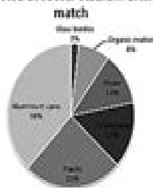
Waste collected at soccer stadium after Saturday match