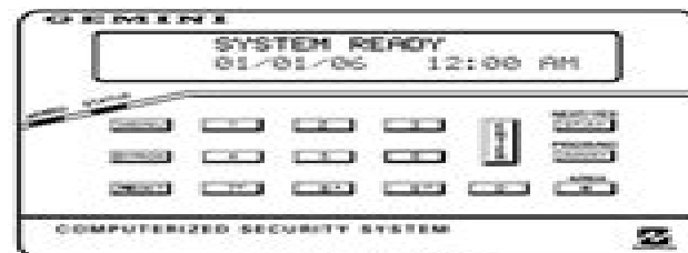
"K Series" GEM-K1CA