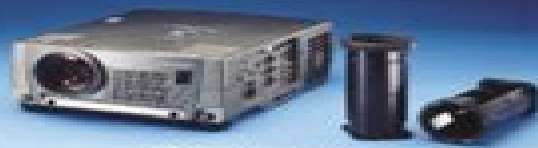
X500U with optional lenses