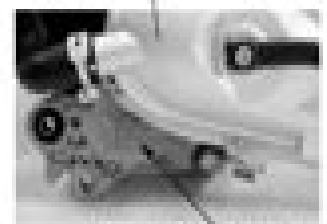
Location of Engine Serial Number