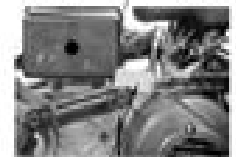
Location of Engine Serial Number