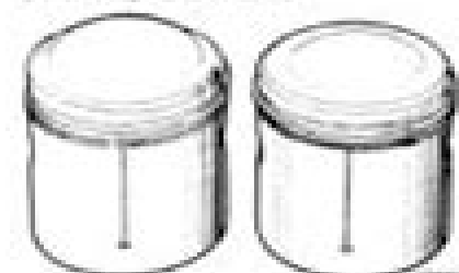
Fig. 41. B-1 COMP. RING

When assembling the engine, connect the wrist end of the connecting rod between the gudgeon pin holes in the piston and ensure that the connecting rod moves up with the crankshaft journal without any pressure being exerted on the rod.