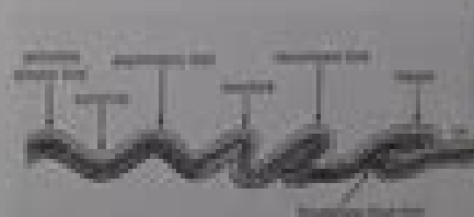
Fig. 19 Types of folding.

is formed (Fig. 19). If it is pushed still further, it becomes a recumbent fold (Fig. 19). In extreme cases, fractures may occur in the crust, so that the upper part of the recumbent fold slides forward over the lower part along a thrust plane , forming an overthrust fold . The over-riding portion of the thrust fold is termed a nappe (Fig. 19). Since the rock strata have been elevated to great heights, sometimes measurable in miles, fold mountains may