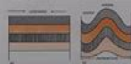
Fig. 18 (a) The horizontal strata of the earth's crust before folding. (b) Compression shortens the crust forming fold mountains.

In the great fold mountains of the world such as